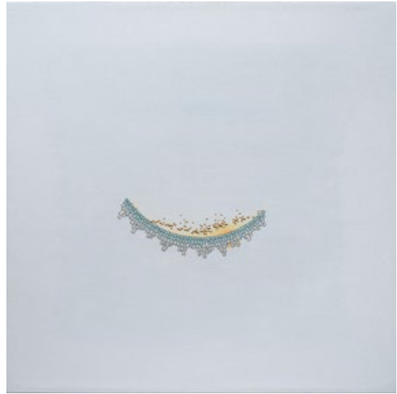
Self Soother 15, 2020

An exhibition statement and images can be found here .