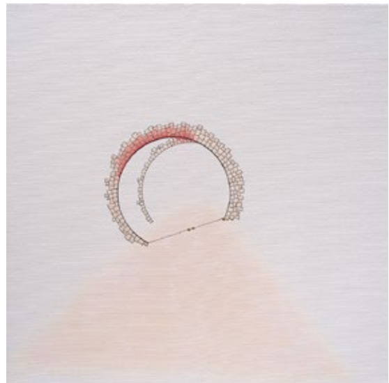
Self Soother 4, 2020