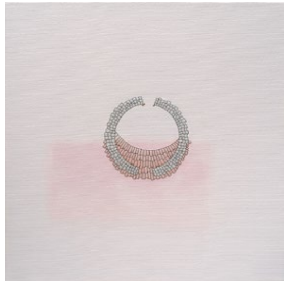
Self Soother 2, 2020