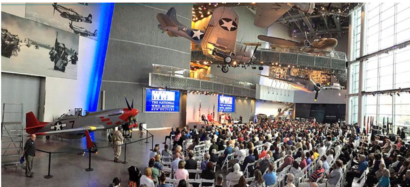
P-51 dedication ceremony on April 21 in New Orleans.