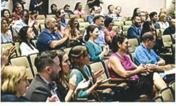
Miramar College Convocation