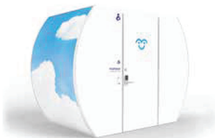
Library Courtyard – Beneath the stairwell

For more details, contact: Student Health Services to register for use and obtain your entry code. 619.388.7881