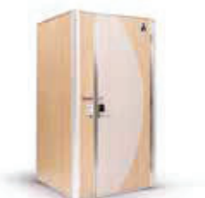
*K1 Building – Next to the Bookstore