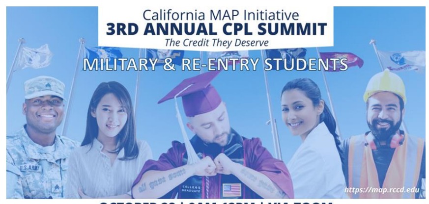
OCTOBER 28 | 9AM-12PM | VIA ZOOM

Mark your calendars for the 2022 3rd annual CPL Summit hosted by the California MAP Initiative, October 28 from 9am 1o 12pm on Zoom . You will gain a deeper understanding of CPL, stay abreast of developments in the field, and learn about emerging strategies, reforms, partnerships, and technologies focused on optimizing CPL throughout the state. There is no cost to attend this virtual Summit.